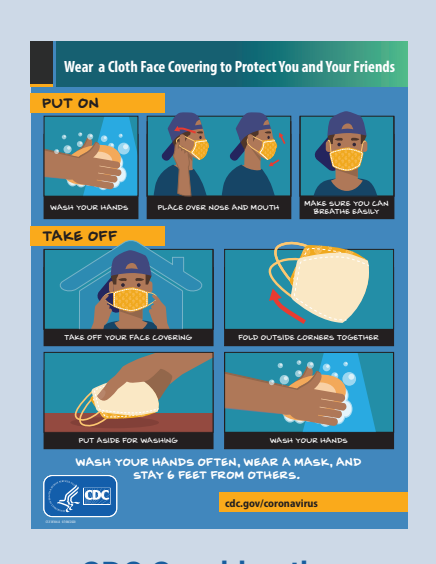
CDC Considerations for Schools

Make sure to completely dry cloth face covering after washing.