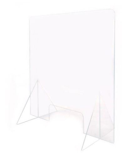
Economy Kit Acrylic barrier Easy-to-assemble acrylic legs