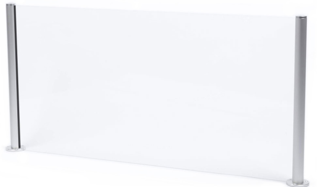
Round StructureLite Magnetic Post Kits Strutrelite round posts 2.5" Diameter magnet mounting plate with adhesive Round extrusion end caps with thread mounts Strutrelite round post bases with set screw 5/32" Hex key wrench for assembly Plastic Spline (sized to order) Acrylic barrier (sized to order)