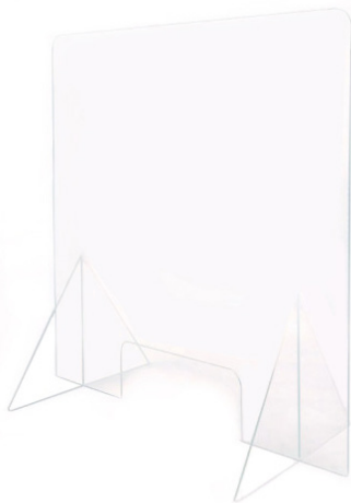
Economy Kit Acrylic barrier Easy-to-assemble acrylic legs