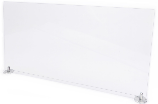
EZ Grip Magnetic Base Kits Assembled EZ Panel Gripper with magnetic base plate 2.5" Diameter magnet mounting plate with adhesive 3/32" Hex key wrench for assembly Acrylic barrier (sized to order)